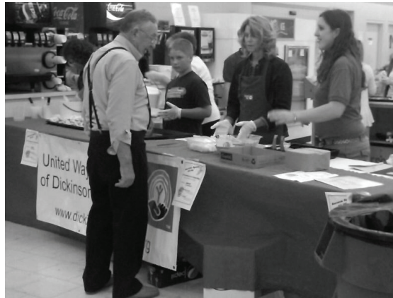
Volunteers serve banana splits on Friday August 19th at Dan's Supermarket North.